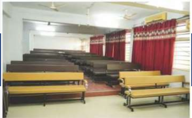
Auditorium: AC Auditorium with capacity of 350 people to conduct seminars, workshops and events.