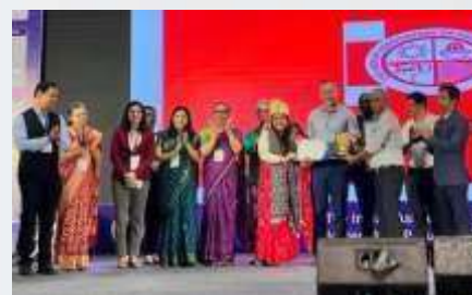
AIMS was awarded for BEST COLLEGE FOR CAMPUS PLACEMENT at 60th IAP national conference, 2023