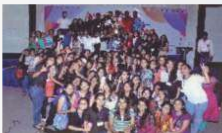
AIMS Won BEST COLLEGE TROPHY in 8th Gujstate Conphys in 2014. (at state level)