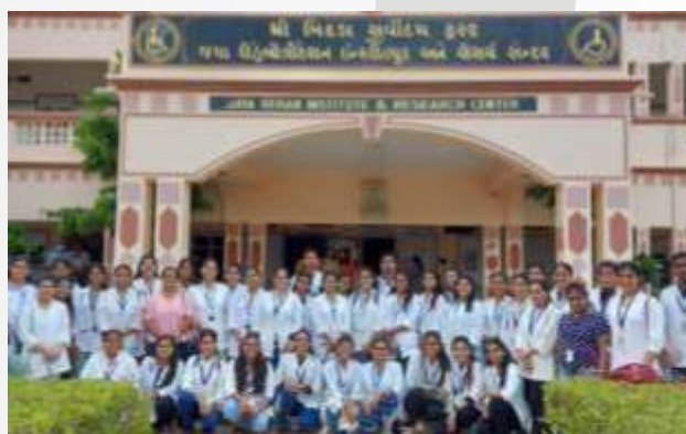
institutional visit at Jaya Rehabilitation centre, Bidada, Bhuj.