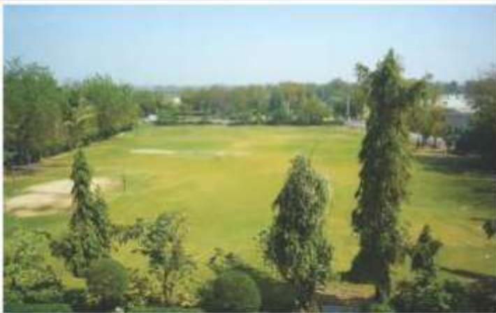
Play Ground : Lush green play ground for various outdoor games.