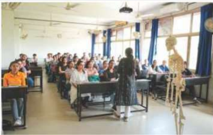
Class Room: All Classrooms are well equipped with Audio-Visual systems, CCTV Cameras and AC.