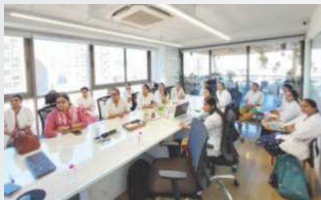
Mission Health, Multi speciality Physiotherapy Centre Ahmedabad.