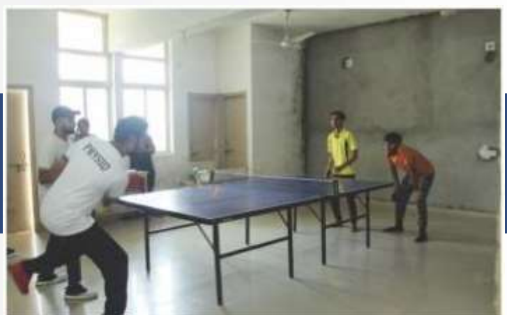
Gymkhana: Provides best leisure time to students with indoor games.