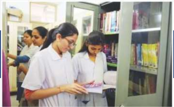
Library: AC Library with more than 4500 books, E- Library, Journals and Reading Room.