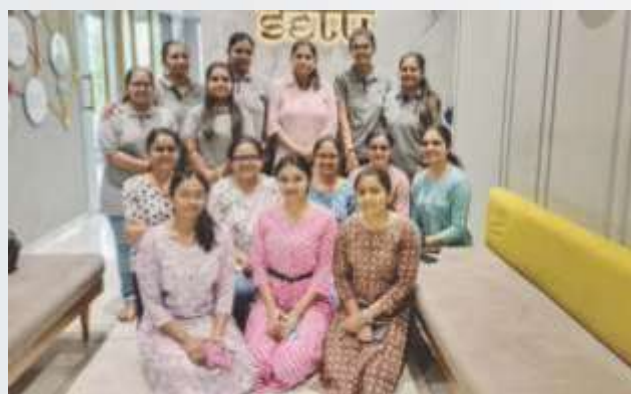
Setoo child development center, Ahmedabad.