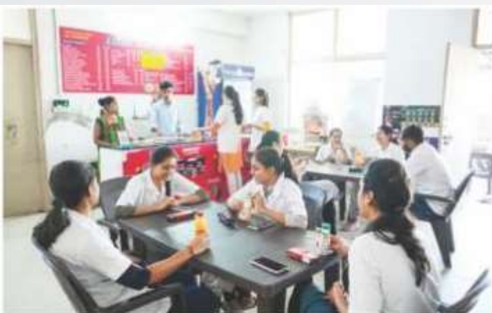
Canteen: Serving good quality hygienic food