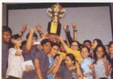
Aims won BEST COLLEGE TROPHY in 2012 at Gujstate Conphys in 2018. Even BEST STUDENT AWARD 2018 was been awarded to the students of AIMS. (at state level)