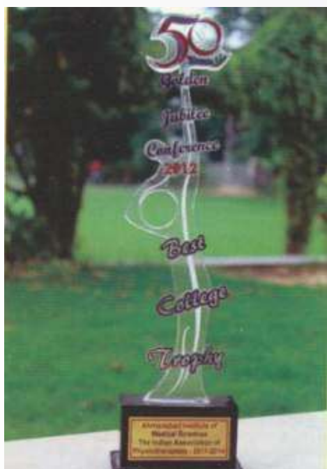
Aims won BEST COLLEGE TROPHY in 2012 at national level conference by Indian association of physiotherapists , in student forum.