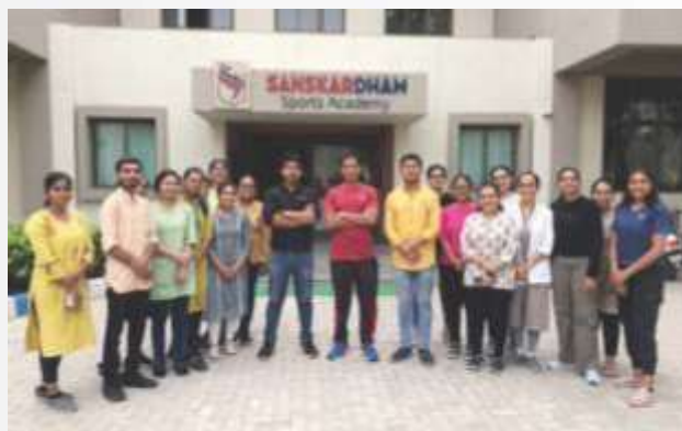
Sanskaar Dham, Ahmedabad - Sports Academy